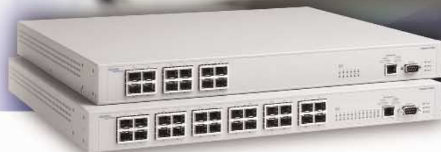
Passport 1612G and Passport 1624G